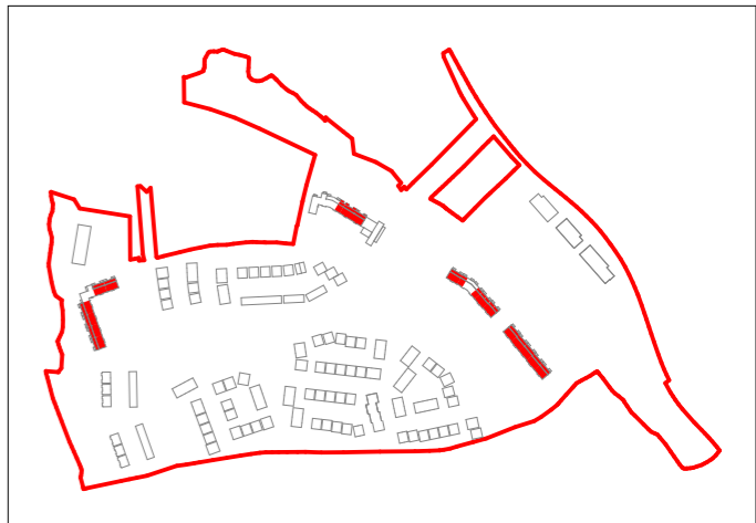
SITE KEY PLAN

NOTE: PLEASE NOTE BUILDING SECTION F1/F2/F3/F4 IS THE TYPICAL BUILDING SECTION FOR HOUSE TYPES F1, F2, F3 & F4. PLEASE REFER DWG NO 18205-PLA-078 TO 18205-PLA-080 FOR GENERAL ARRANGEMENT OF HOUSE TYPE F3 & F4